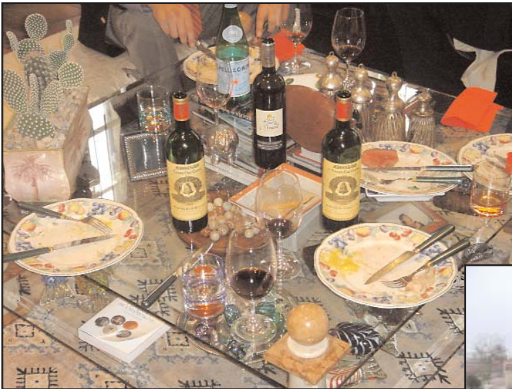
A LIGHT LUNCH AT ANGELUS

And the wines you say? Well, we loved the 2004 dry white wines,