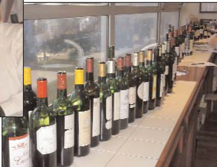
TASTING AT COMPAGNIE MEDOCAINE

flowering. Well, this is exactly what happened. Small showers from the 29th May to the 1st of June set in motion the most rapid and effective flowering that anyone could remember. It was quickly over during the heat-wave of June 7th-9th. June now became the month when hopes were at their highest, especially when it continued to be exceptionally hot throughout the month. Rain was badly needed, but at least all this dry weather meant that many growers could skip the mildew treatments. High hopes in June would soon turn south.