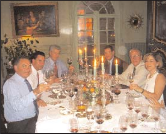
DINNER AT NEGOCIANT PIERRE ANTOINE CASTEJA'S HOUSE