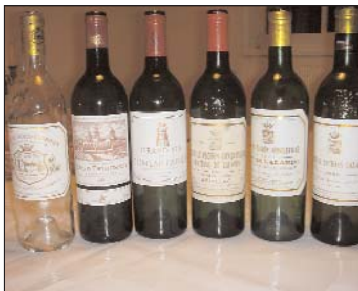
TYPICAL DINNER WINES CONSUMED IN BORDEAUX

After the freakishly early 2003 vintage, the earliest harvest since 1893,