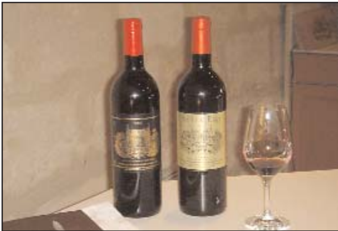
THE WINES OF CHATEAU PALMER