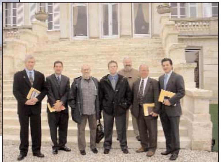
THE ENTIRE GROUP AT CHATEAU DUCRU-BEAUCAILLOU