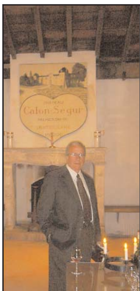
CLYDE AT CALON-SEGUR

49% Semillon and 51% Sauvignon Blanc. Outstanding ele-