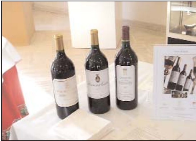
OFFERINGS FROM CHATEAU PICHON-LALANDE