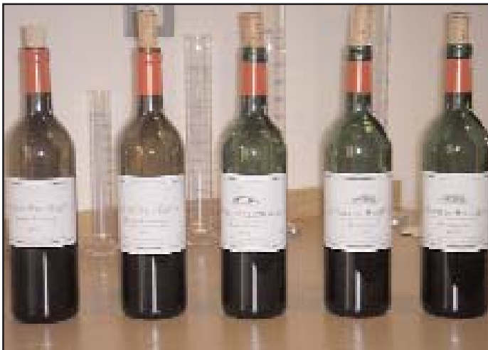
THE WINES OF HAUT-BAILLY

showed so fresh and alive! Regal nose that is concentrated. Some minty aromas and flavors. Fresh and delicious, round fruit covers every area of the mouth, elegant finish, loaded with class. Very long finish and it lasts for a minute on the palate. One of the best of the vintage.