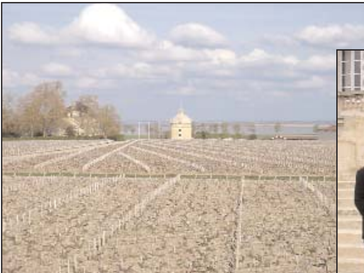
THE TOUR OF CHATEAU LATOUR

In the run-up to the flowering, a process that requires enormous energy from the vine, some rainfall was needed. The best scenario would be just a little rain to get things going then hot and dry weather for the